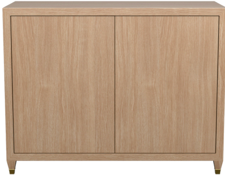
Finish Shown: White Oak