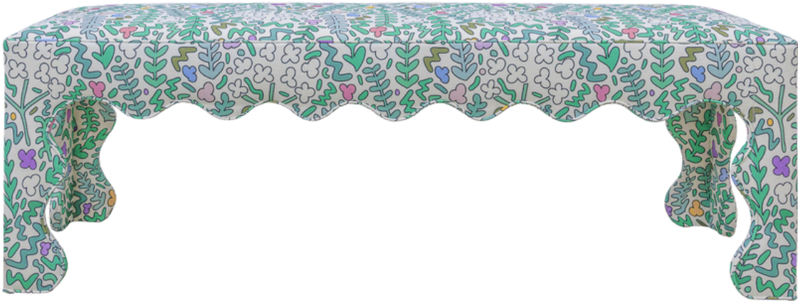
Fabric Shown COM- Fiields of Joy White / Self welt